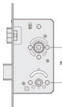
Fig.: WC type